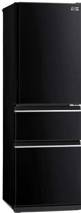
MR-CX402EJ 402 Litres