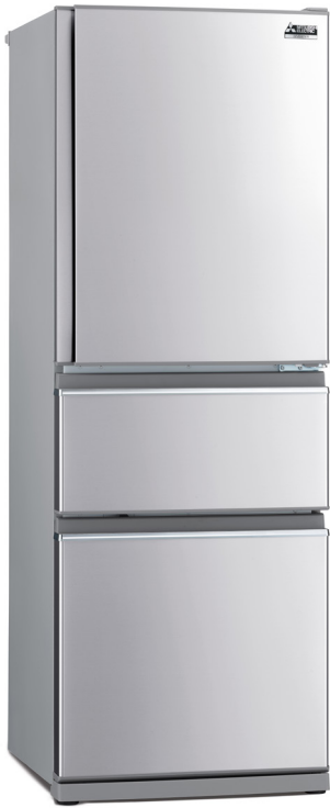
MR-CX492EP 492 Litres